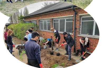
Activities delivered by Heath Hands 2022-23 (total 375)